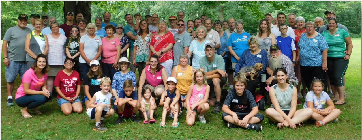
LUMC 2018 Church Picnic at Slate Run Metro Park

Inviting people to be in relationship with Jesus and each other so that lives and communities are changed